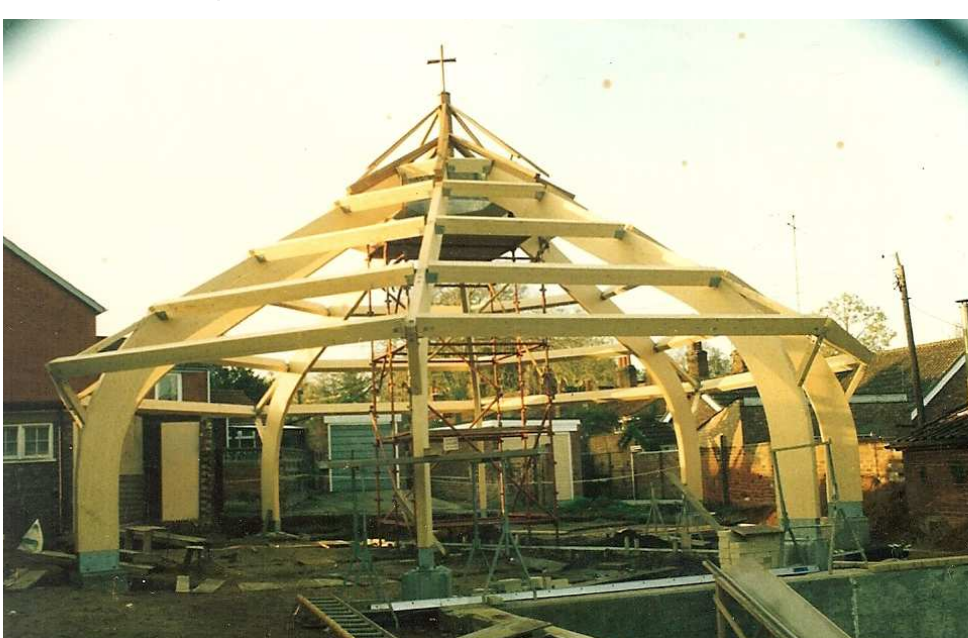
Construction of the Octagon