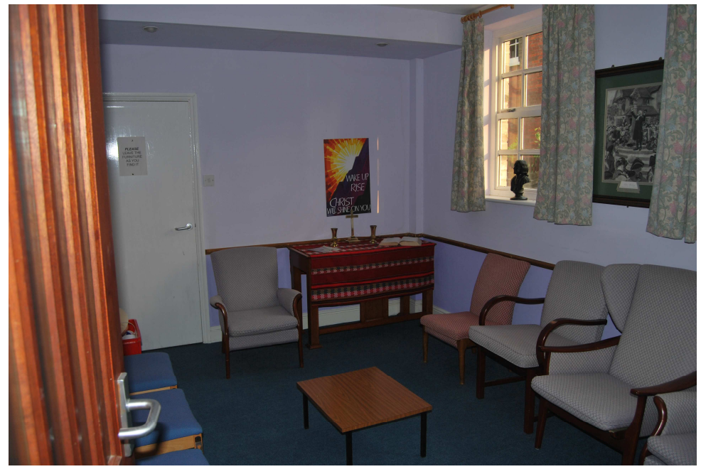
The Wesley Room - Picture taken May 2010

suggestion. Occasionally, time seems to move very slowly, particularly for the impatient ones amongst us, but on reflection, the period of steady growth and consolidation provided the springboard for the major changes which were to come when the time was right.