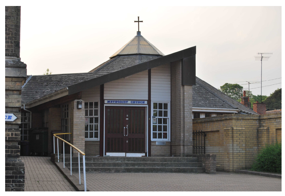
The new entrance - Picture taken May 2010 took place in the 1980s and 90s.

As far as an historical account of a living and vibrant society is concerned, by the time it appears in print it is already out-of-date. This series of articles on the history of the Woodbridge Church ends, therefore, with the changes to the buildings which