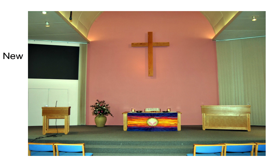
The Sanctuary - Picture taken May 2010

The planning of the new Sanctuary had been carried out with great care and sensitivity, and with the help of more than one friend experienced in interior design. The worship area, now located at the "road" end of the Church, would be dominated by a large, simple wooden cross placed high on the wall and formed from the same pale wood as the communion table, the pulpit and the font. All were specially designed and, with the carefully chosen chairs and carpeting, an ambience lending itself to worship and many other activities was created. A much researched and carefully selected new organ was sited on the balcony created at the opposite end of the room. The acoustics in the Sanctuary are held to be very good.