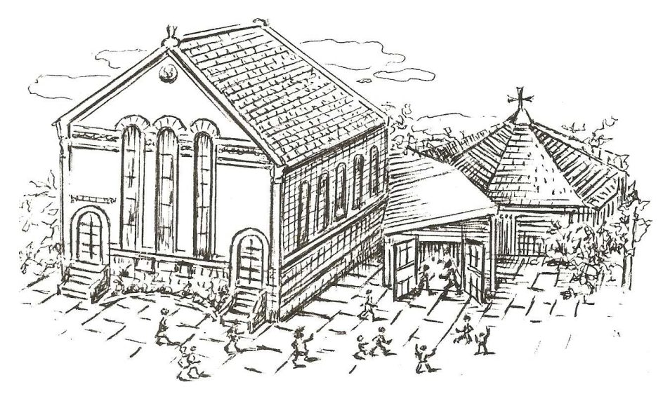
Artists impression of how the new extension was envisaged.

The Church moved in the only direction open to a growing Christian community - forward.